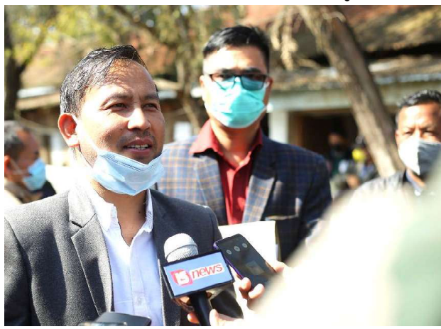
IT News Imphal, Feb 7: