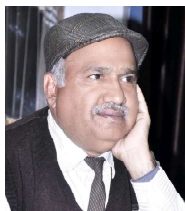
By: Vijay Garg

According to the order of the NMC, in the colleges where 50% seats are fixed under the government quota,