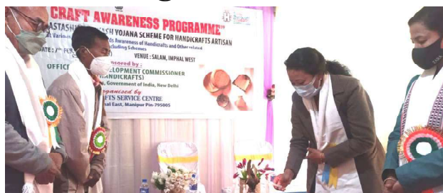
IT News Imphal, Feb 7:

One Day Craft Awareness Programme was held today under Ambedkar Hastashilpa Vikash Yojna Scheme for Handicrafts Artisan at Salam, Imphal West. The programme was or-